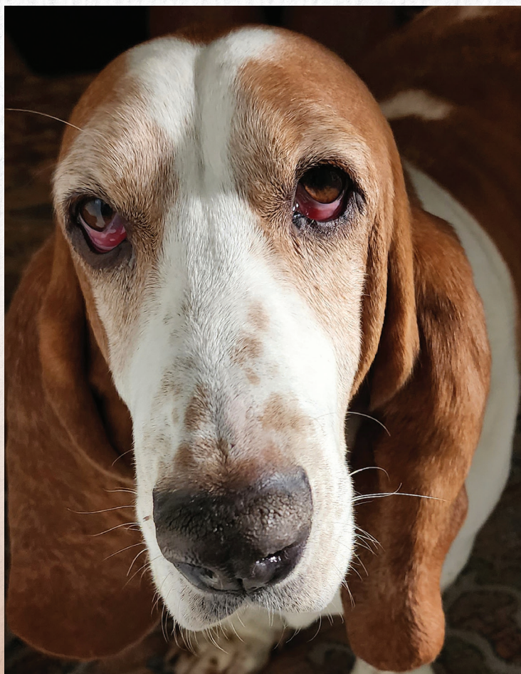
BHRSC HELPED GUIDE LENNY AND HIS FOSTERS THROUGH MEDICAL AND BEHAVIOR ISSUES.

While the goal of any dog rescue is to find forever homes, fosters are a crucial part of the rescue process and provide an immediate home for stray or surrendered dogs. Many of the hounds rescued by BHRSC—about 75%—go directly to adoption or foster-to-adopt homes, but some hounds need more specialized attention and a training plan customized to address specific behavioral issues.